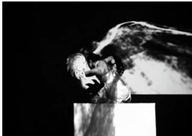
GREY LINES, Dance Project, 2014