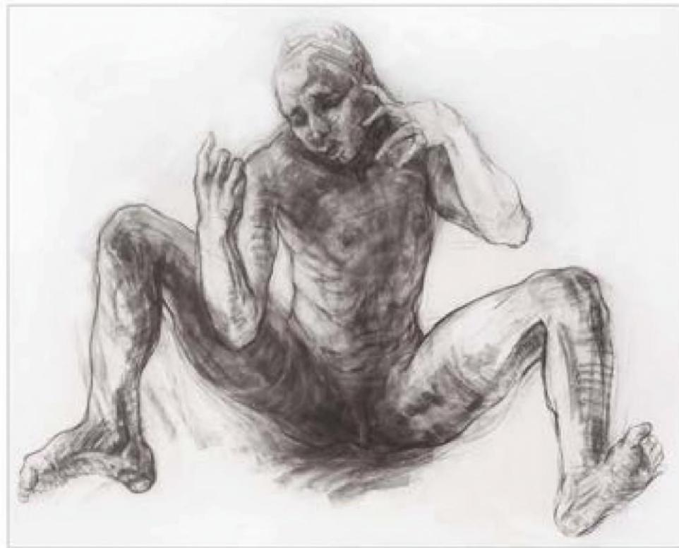
BABY, 117 by 148 cm, Compressed Charcoal on Paper, 2015