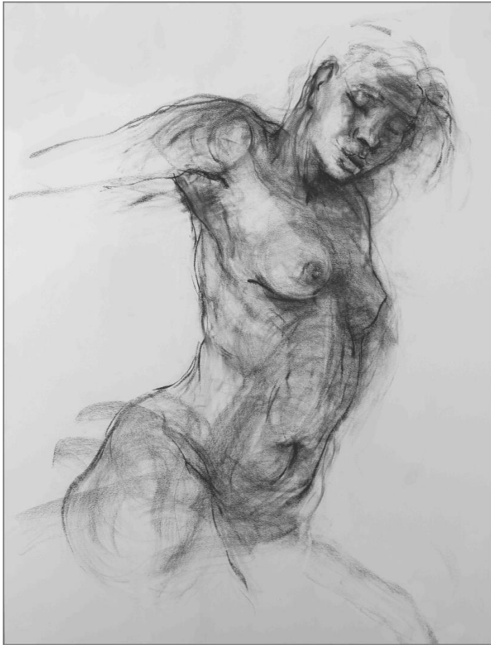
TRINA FREE, 110 by 81 cm, Compressed Charcoal on Paper, 2020