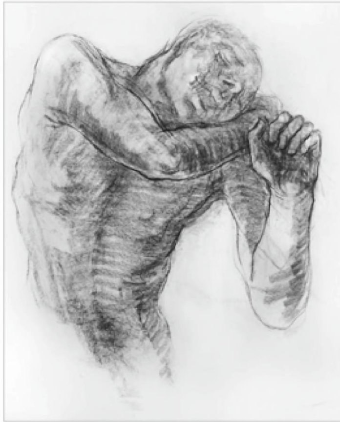
JUST A MOMENT, 79 by 78 cm, Compressed Charcoal on Paper, 2014