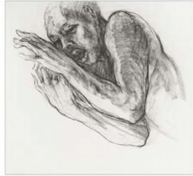
INTIMACY, 70 by 76 cm, Compressed Charcoal on Paper, 2014