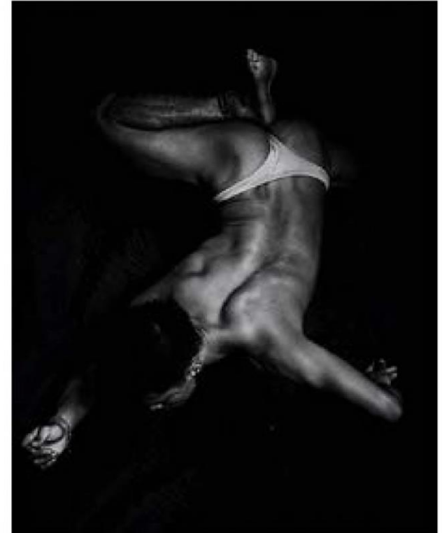
FIVE NEW ANGELS, Dance Film, 2017