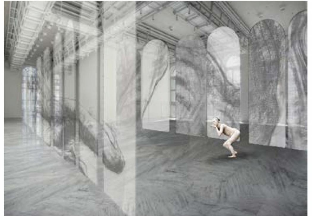
REVERBERATION, Faena Building, Argentina, 2016