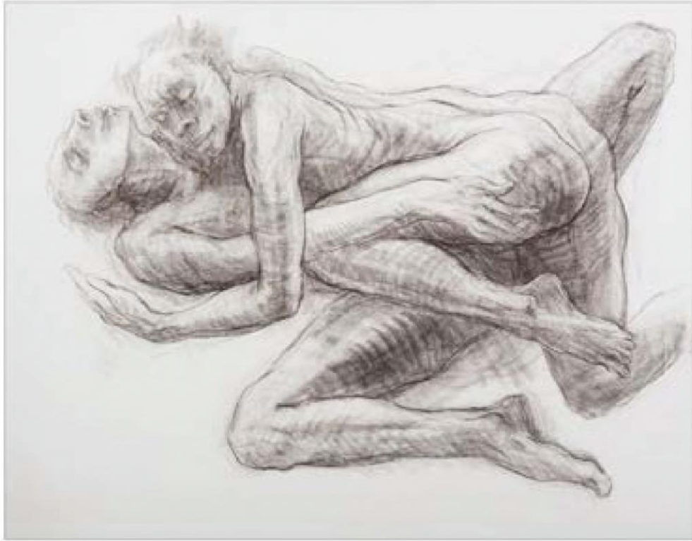
ARI DOUBLE, 115 by 146 cm, Compressed Charcoal on Paper, 2016