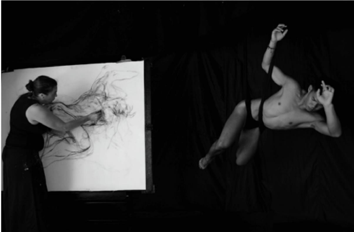
LINES OF LIGHTNESS, Dance Film, 2017