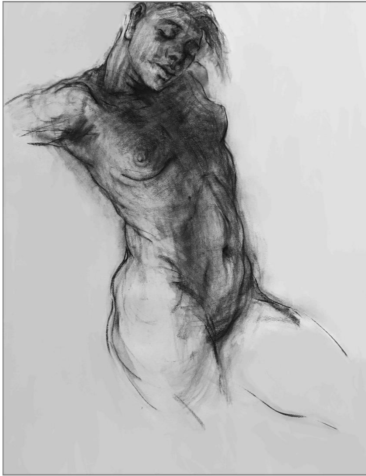
MOMENT TRINA, 110 by 81 cm, Compressed Charcoal on Paper, 2020