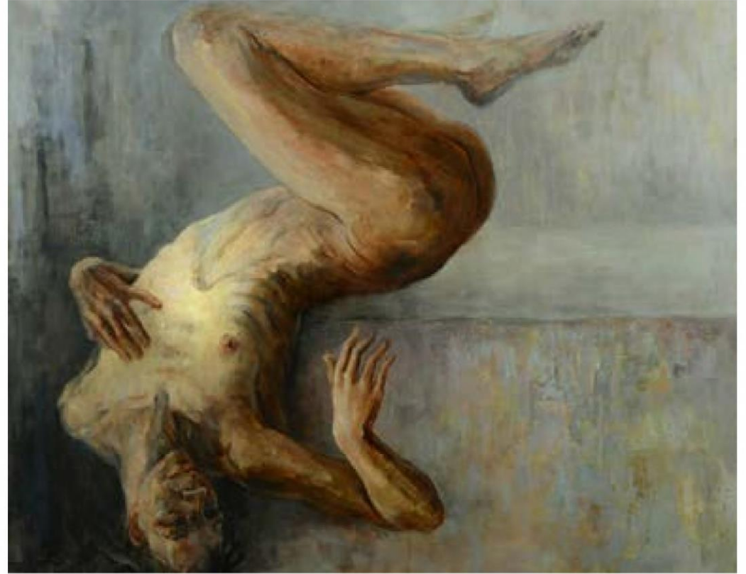
WATERFALL, 120 by 139 cm, Oil on Panel, 2015