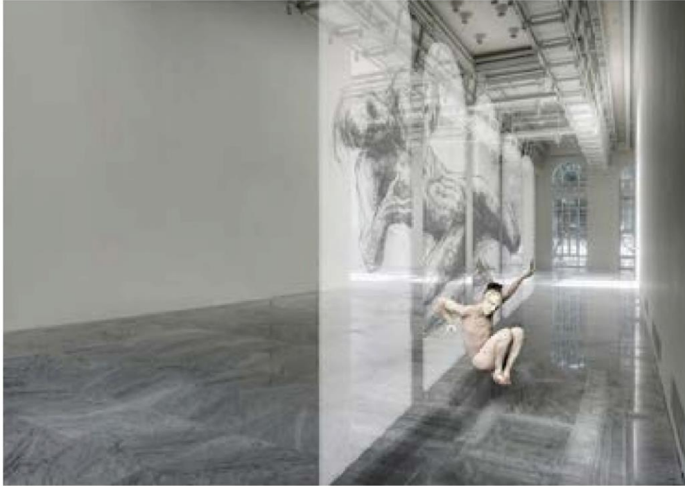
REVERBERATION, Faena Building, Argentina, 2016