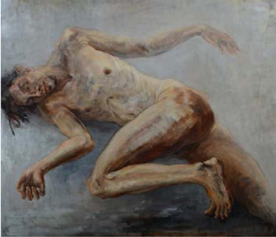
ARI, 120 by 139 cm, Oil on Panel, 2016