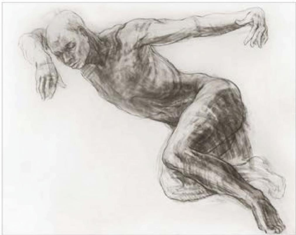
ANGEL, 118 by 147 cm, Compressed Charcoal on Paper, 2015