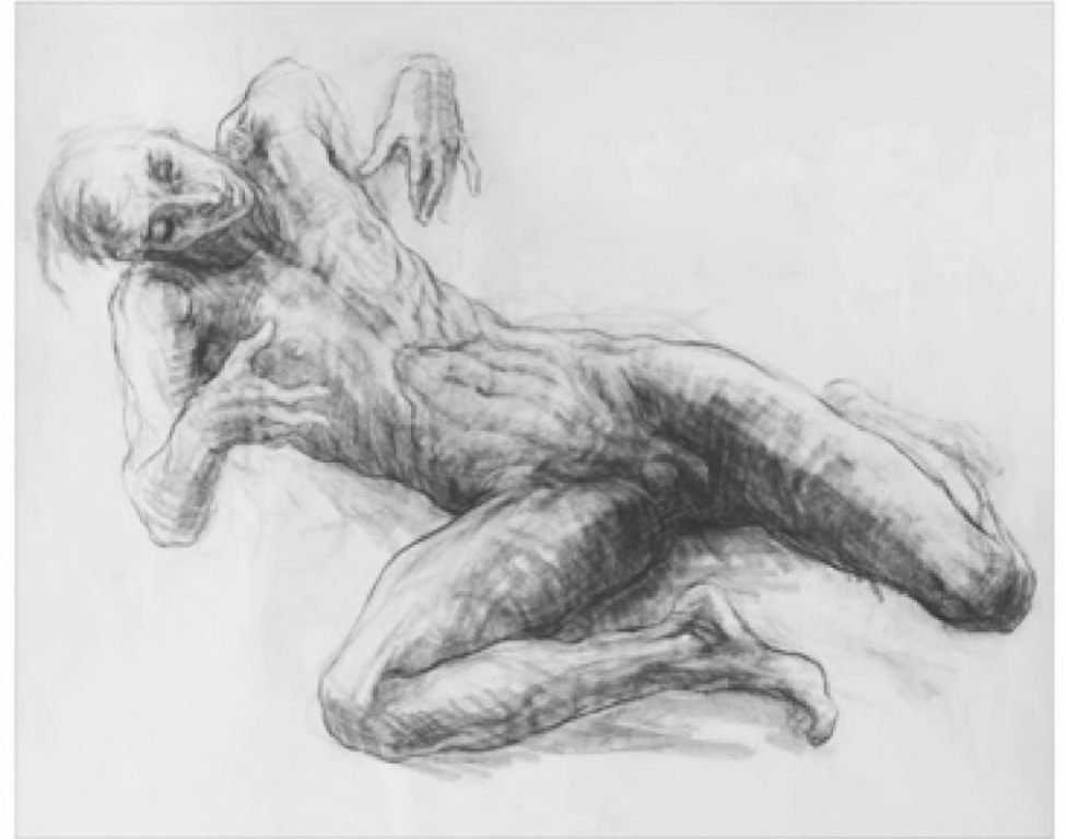
ARI SOFT, 120 by 148 cm, Compressed Charcoal on Paper, 2016