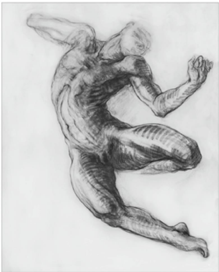
BEACH WALK, 147 by 115cm, Compressed Charcoal on Paper, 2017