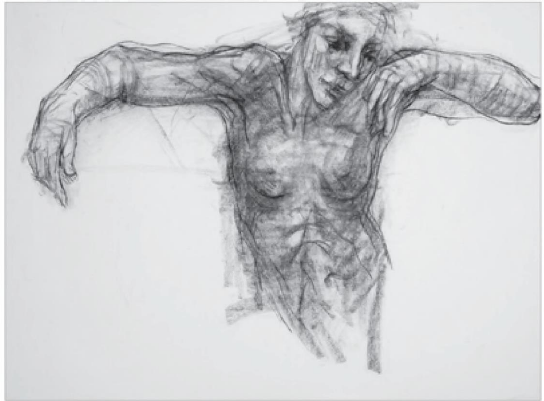
SWAN, 80 by 110 cm, Compressed Charcoal on Paper, 2014