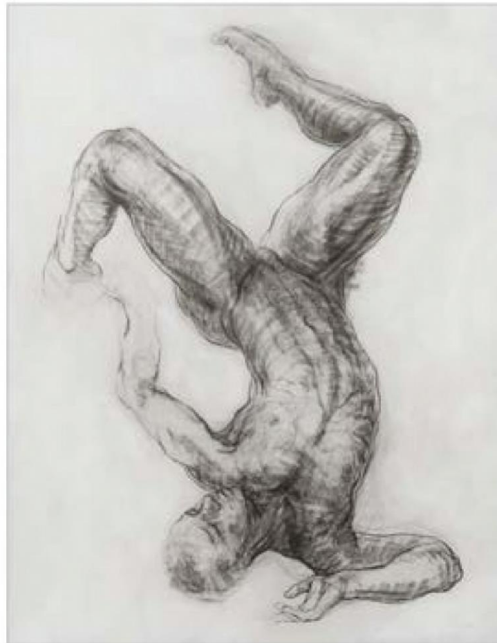
HANGING, 148 by 115cm, Compressed Charcoal on Paper, 2017