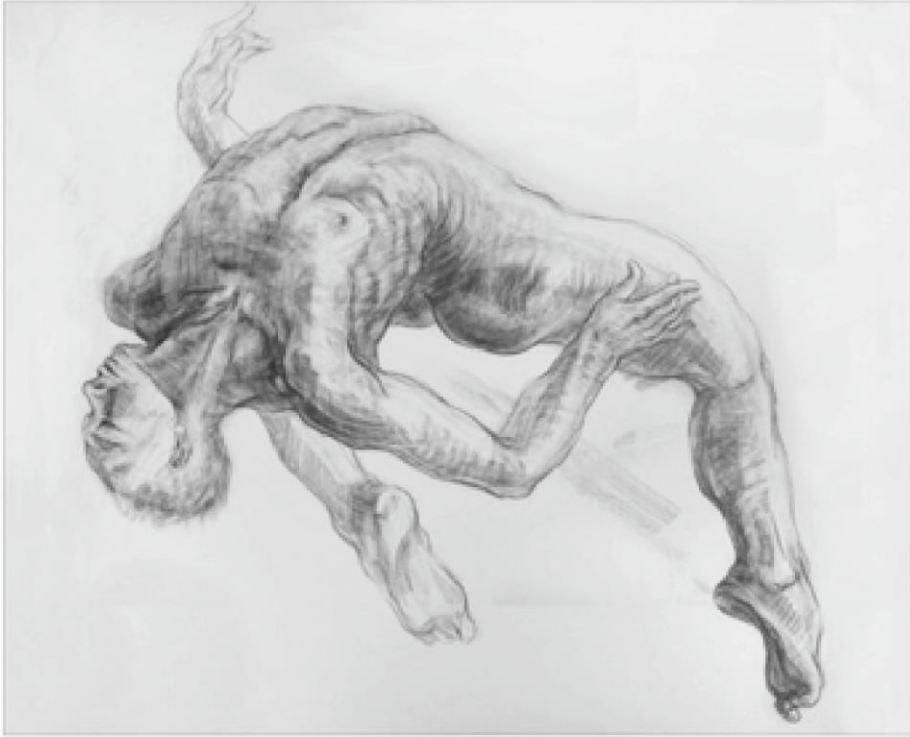
BRIDGE, 118 by 742 cm, Compressed Charcoal on Paper, 2017