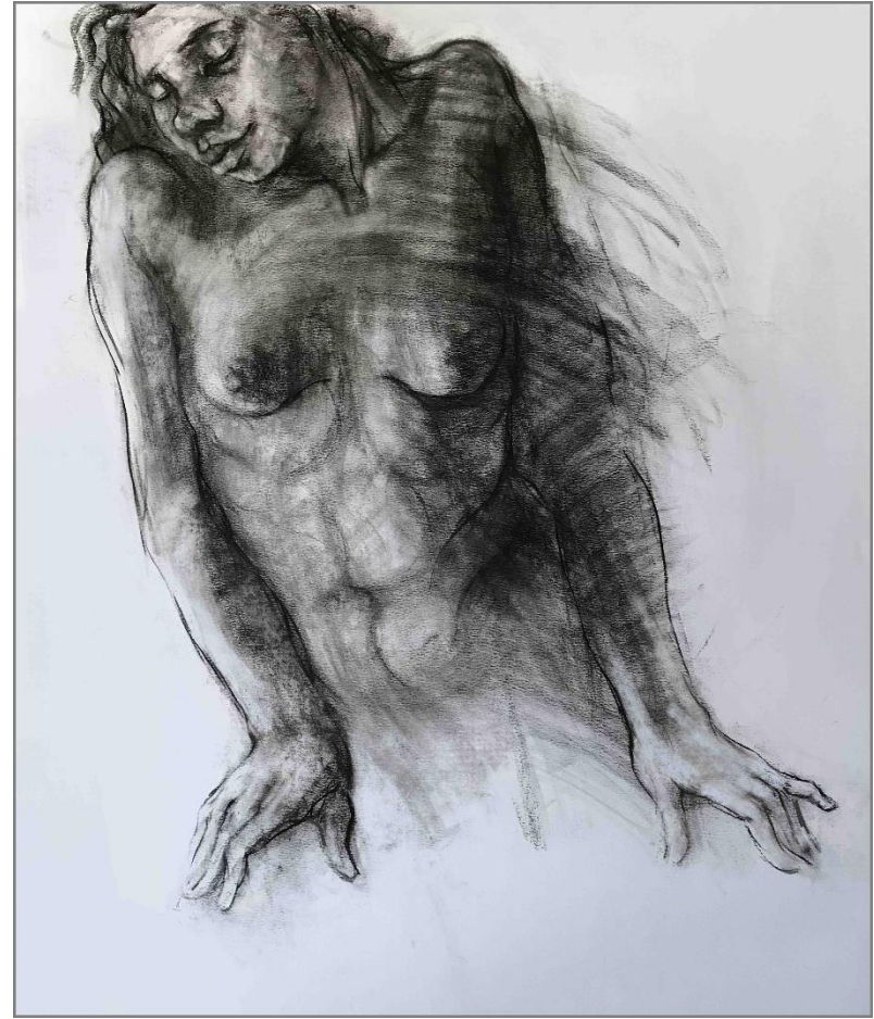
TWO HANDS, 110 by 81 cm, Compressed Charcoal on Paper, 2021