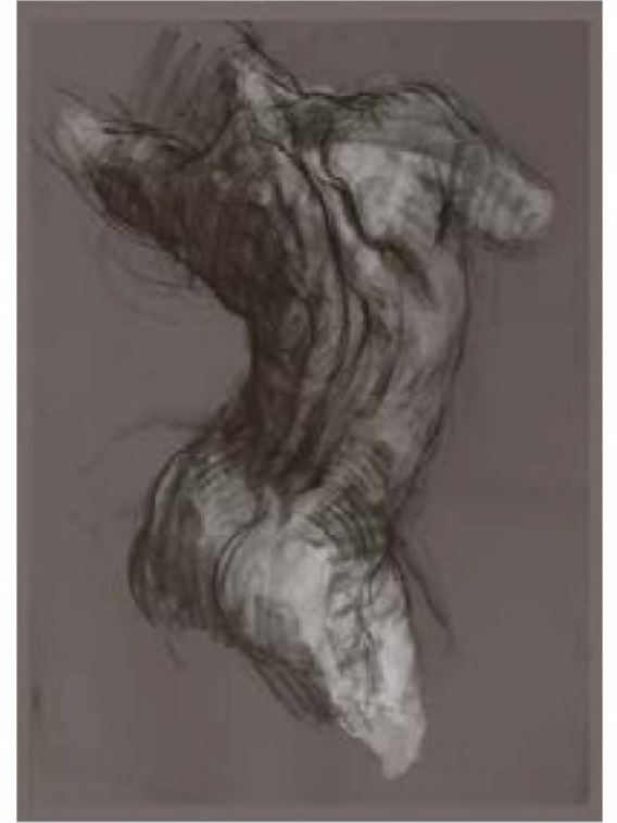
Digital Drawings, 2018