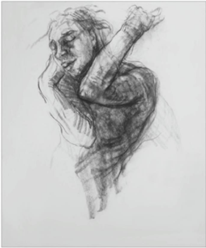
SWAN, 80 by 110 cm, Compressed Charcoal on Paper, 2014