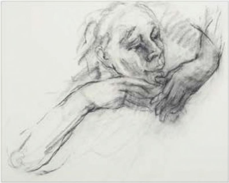
DARINKA PORTRAIT, 62 by 75 cm, Compressed Charcoal on Paper, 2016