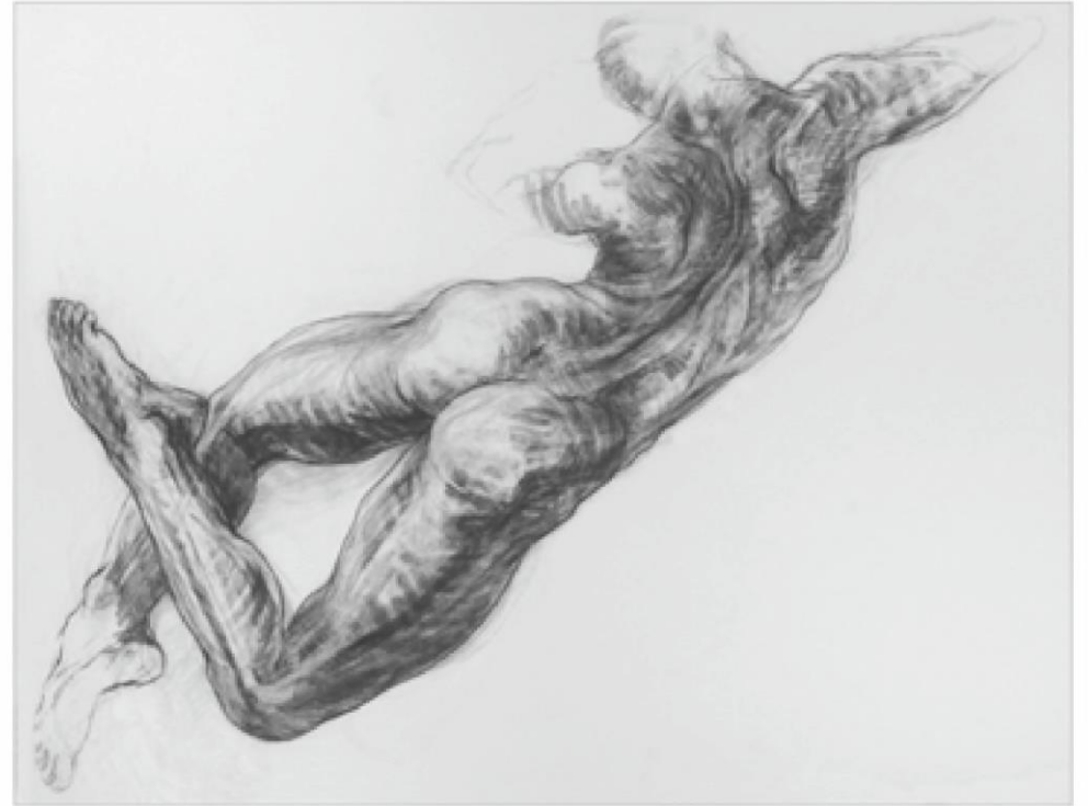
JUICY, 113 by 750 cm, Compressed Charcoal on Paper, 2017