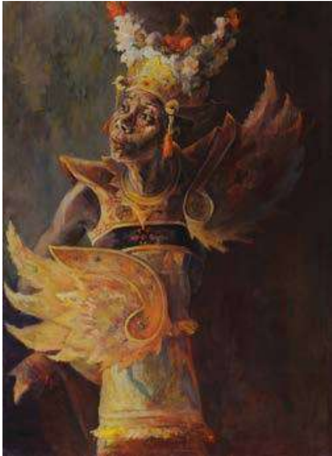
GARUDA LEGONG DANCE, 115 by 82 cm, oil on canvas, 2016