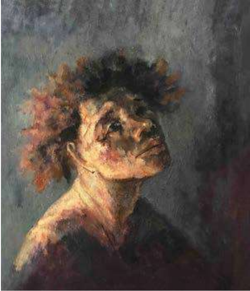
BOY, 60 by 50 cm, oil on canvas, 2018