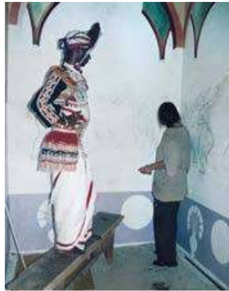
BUDDIST TEMPLE PROJECT (process), Kataluwa Temple, Sri Lanka, 2002