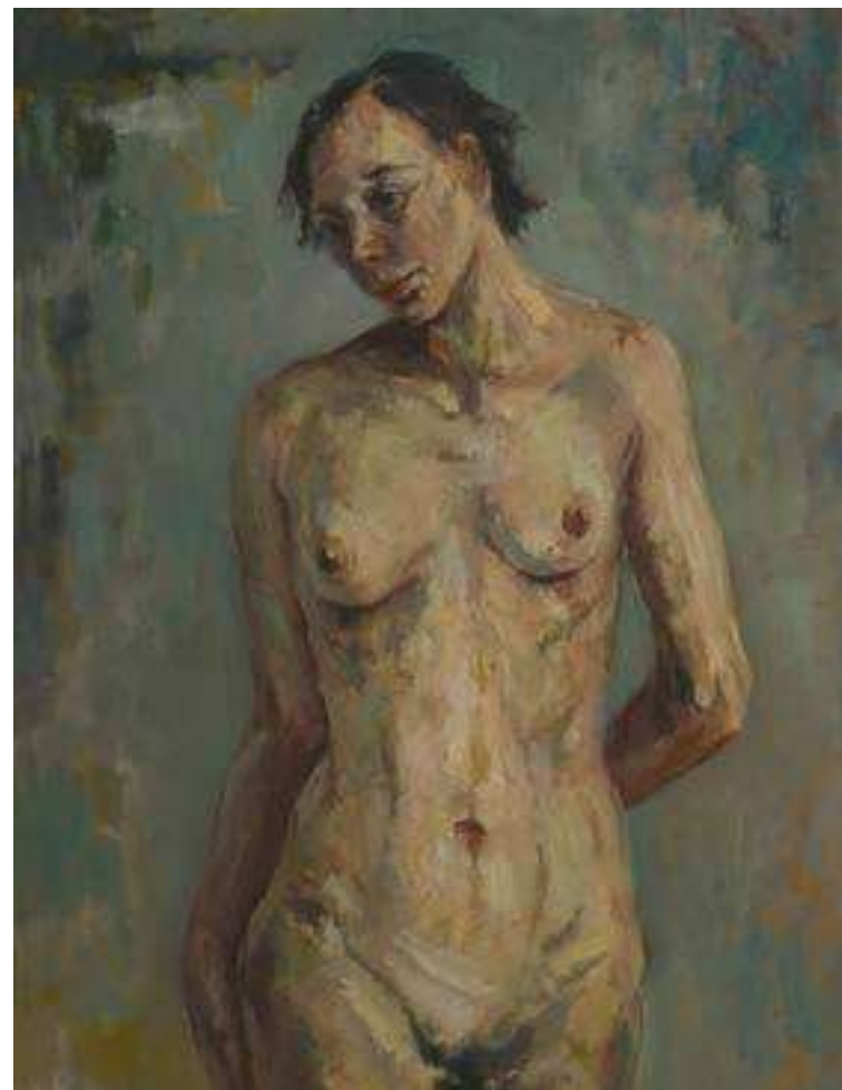
MOUSE, 63 by 49 cm, oil on canvas, 2016