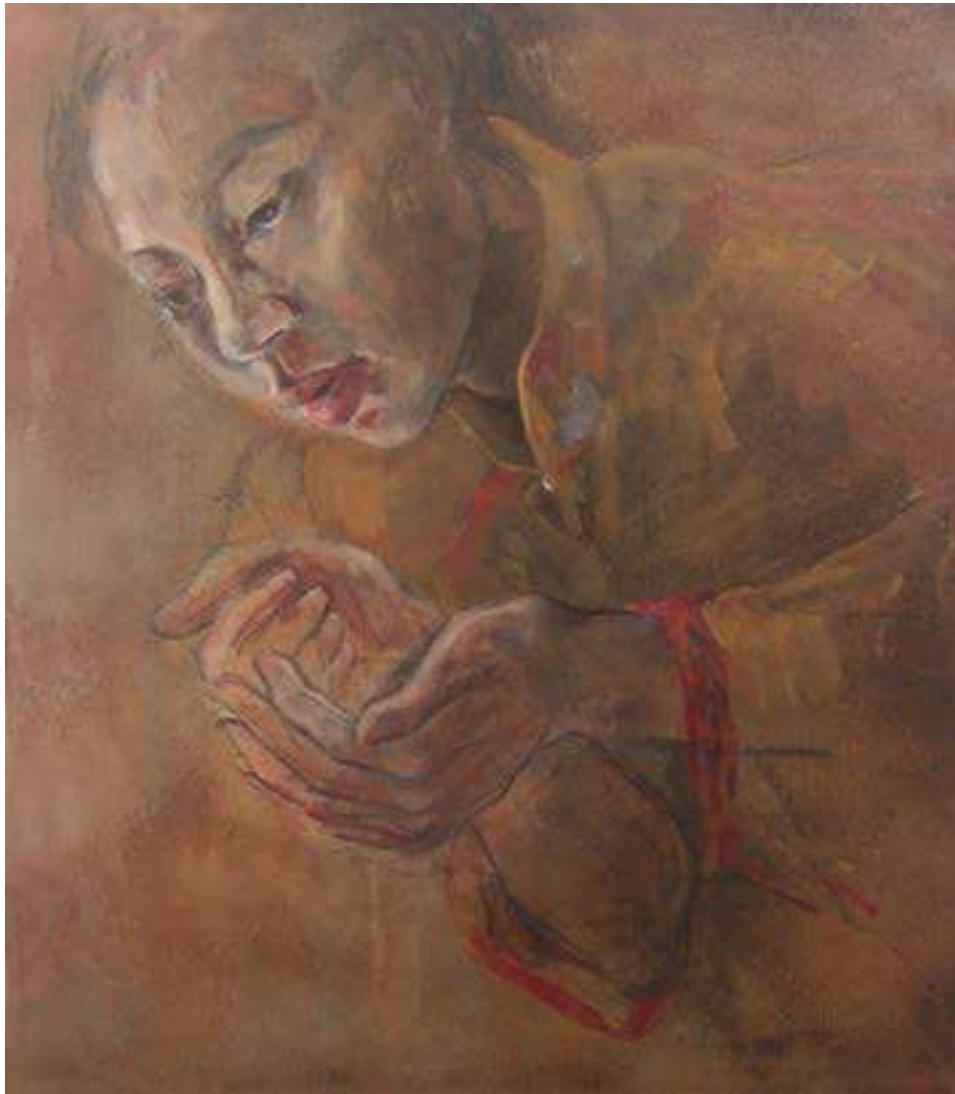
THUY IN YELLOW MIST, 56 by 49 cm, oil on canvas, 2008