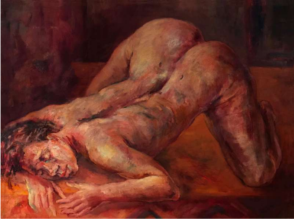
MOUNTAIN, 80 by 100 cm, oil on canvas, 2019