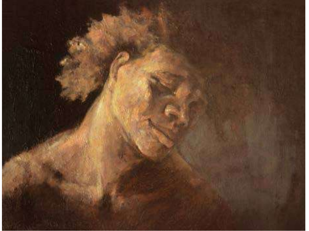
ALFO DREAM, 42 by 68 cm, oil on canvas, 2018