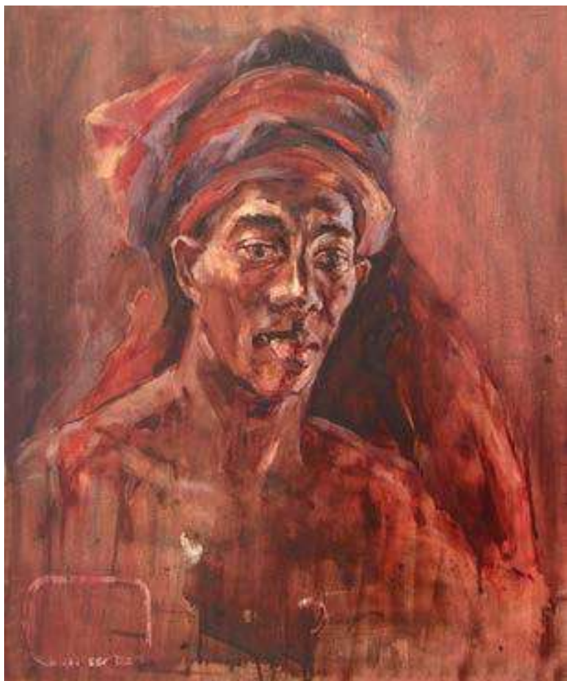
DOMINIEK, 51 by 60 cm, oil on panel, 2004