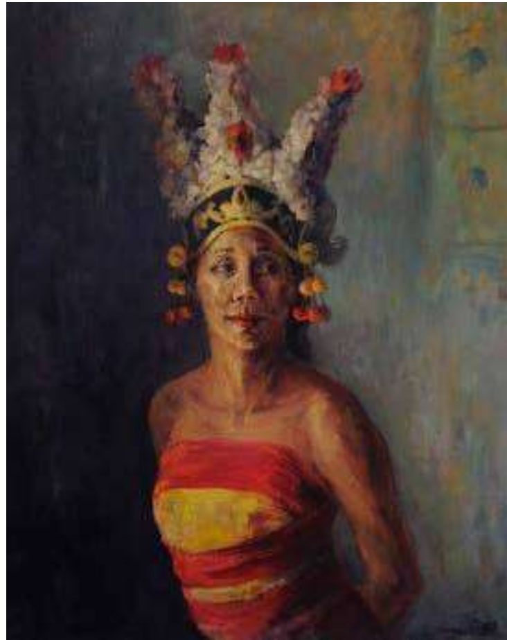
DAYU, 99 by 79 cm, oil on canvas, 2016