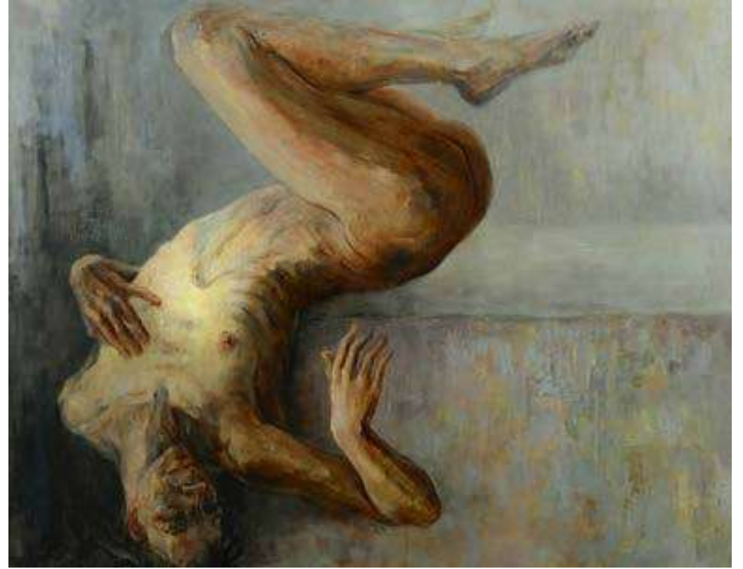
WATERFALL, 120 by 139 cm, oil on panel, 2015