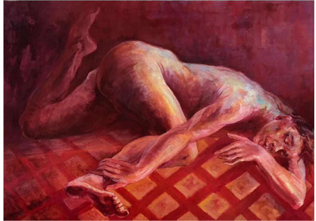
GLACIER, 90 by 120 cm, oil on canvas, 2019