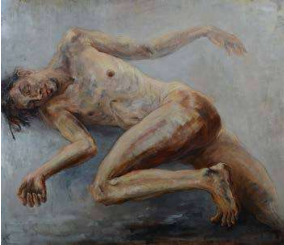
ARI, 120 by 139 cm, oil on panel, 2015