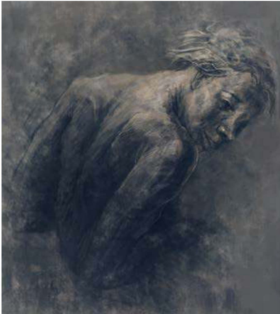
KARETH, digital drawing, 2018