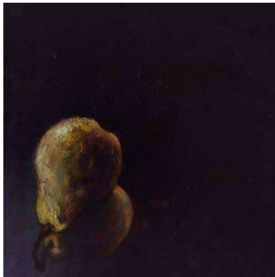
ONE PEAR, 27 by 26 cm, oil on canvas, 2018