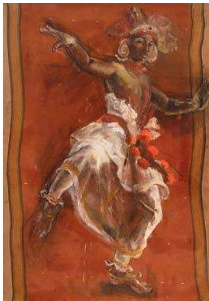
KANDY DANCER, 200 by 125 cm, oil on panel, 2004