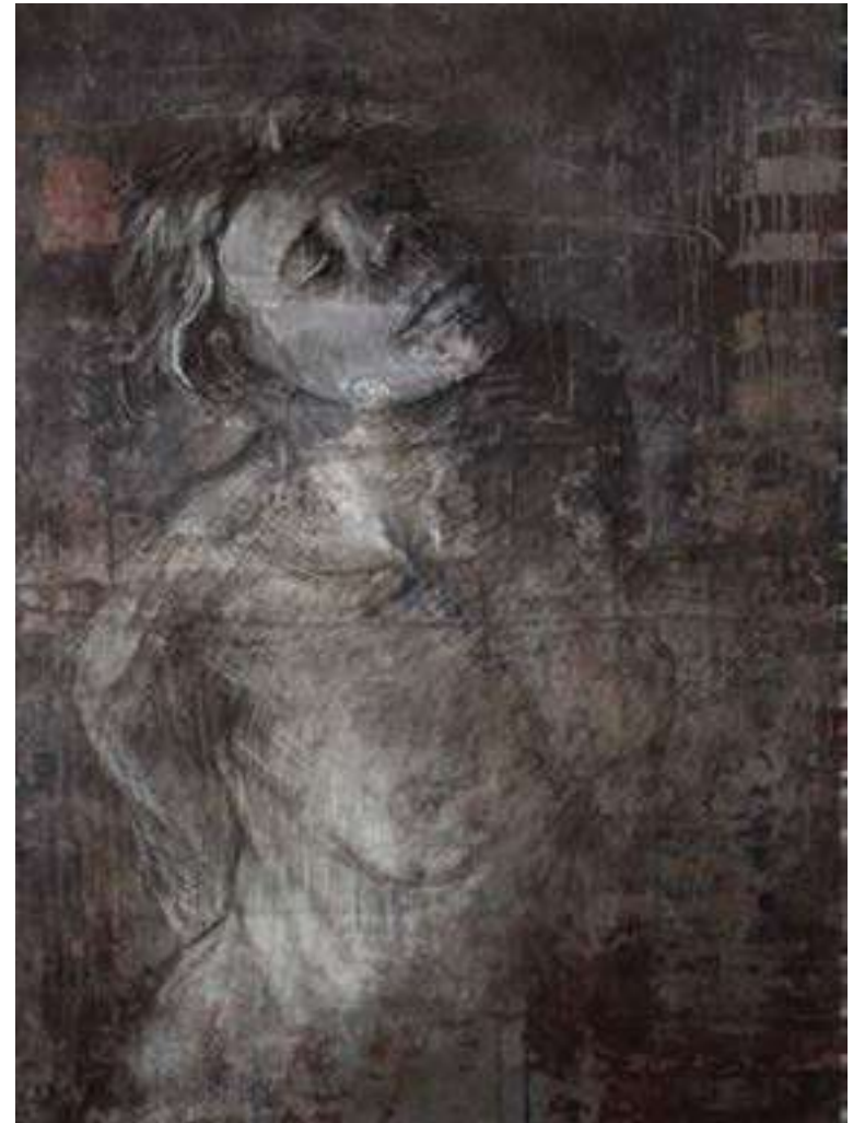
JORIS, digital drawing, 2018