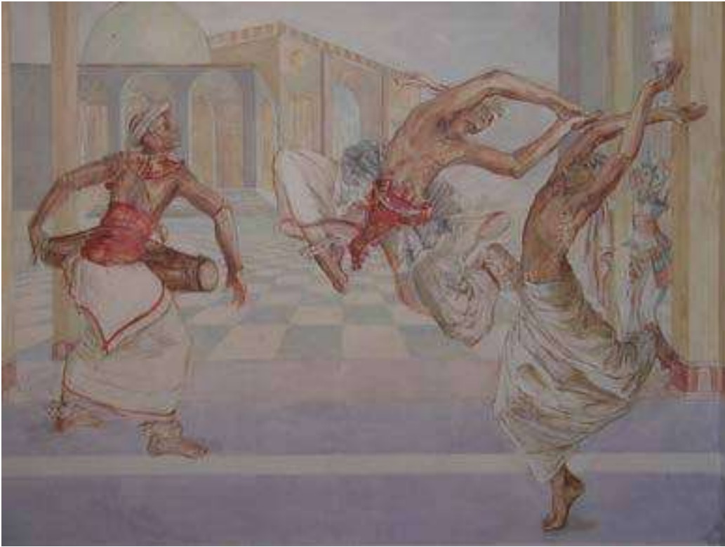
BUDDHIST TEMPLE PROJECT (detail), Kataluwa Temple, Sri Lanka, 2002