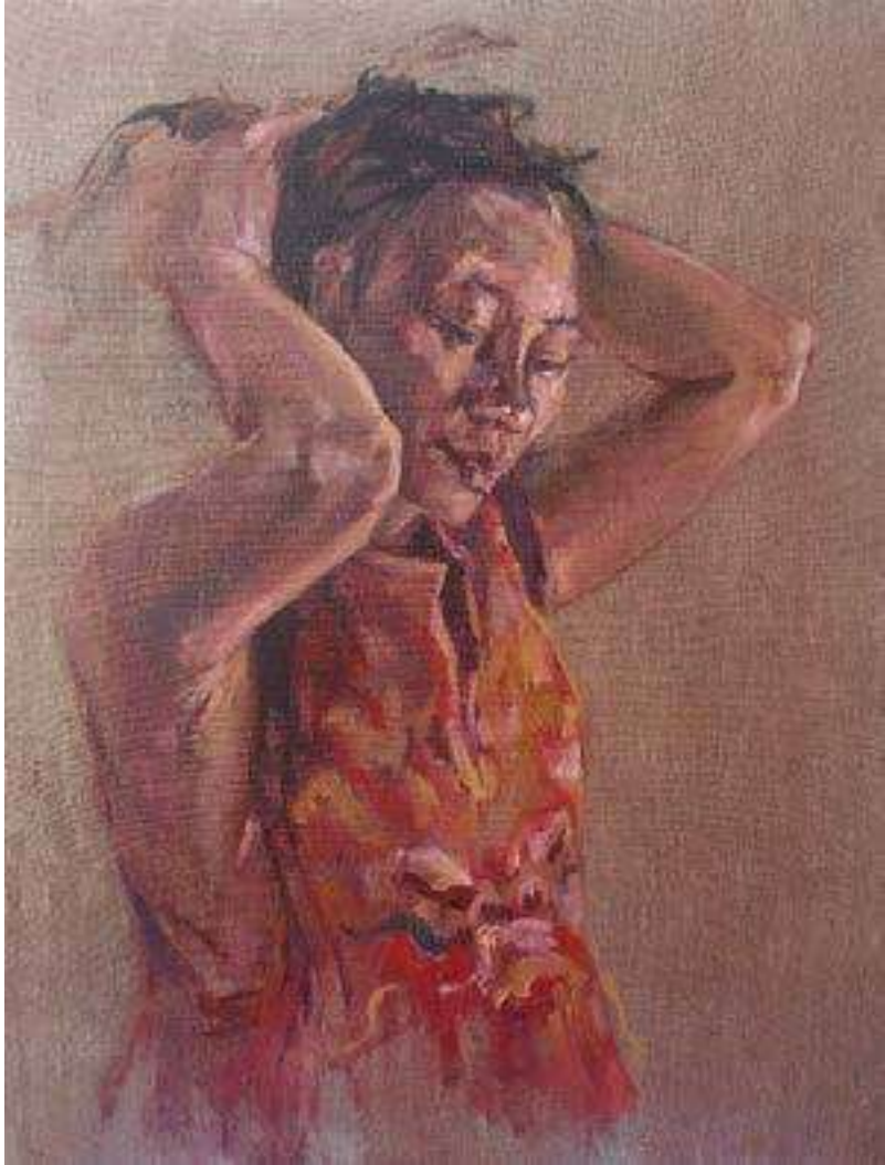
APRON, 80 by 60 cm, oil on canvas, 2009