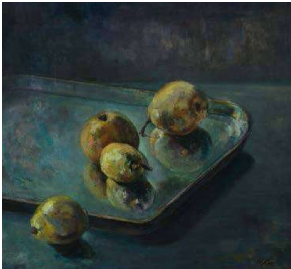
FRUITS, 43 by 47 cm, oil on canvas, 2018