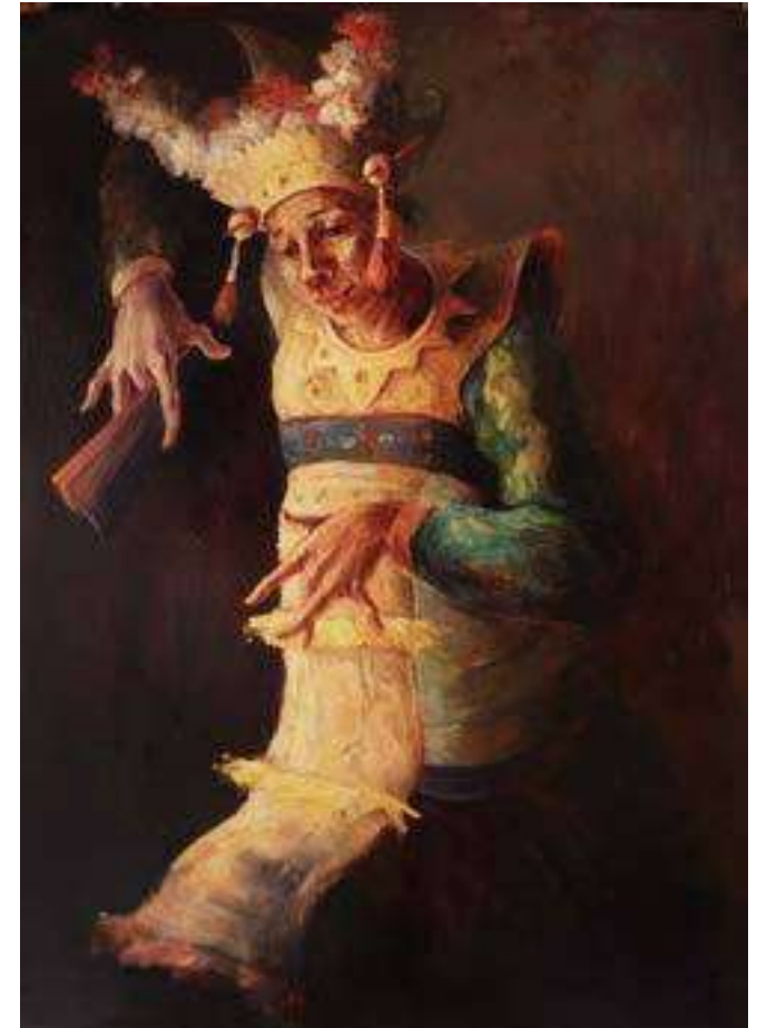
LEGONG DANCE DRANCE, 115 by 82 cm, oil on canvas, 2012