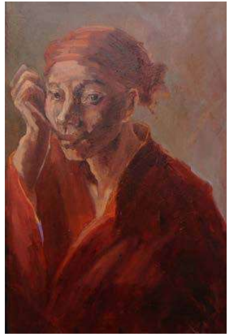
PORTRAIT MONK, 38 by 58 cm, oil on canvas, 2008